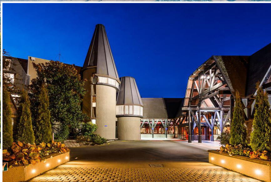
Chateau on the Park, Christchurch

Further details on sponsorship opportunities are enclosed. We would welcome the opportunity to discuss how your organisation could be involved in supporting the conference.