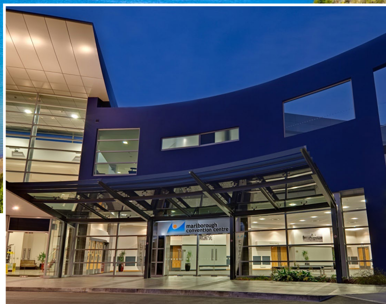
Marlborough Convention Centre

Marlborough Convention Centre is set in the heart of Marlborough and the beautiful regional centre of Blenheim and on the banks of the Taylor River, the Marlborough Convention Centre boasts state of the art facilities offered in a relaxed and tranquil setting that will enhance your event.